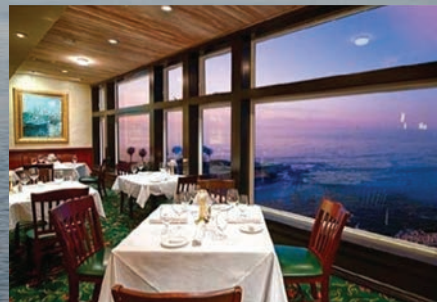
Interior with view