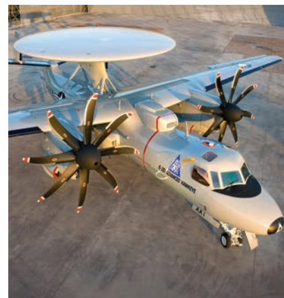
Japanese E-2D Advanced Hawkeye

In 2014, the Japanese Ministry of Defense competitively selected the E-2D to fulfill the nation's airborne early warning requirements. The Japan Air Self-Defense Force has operated the E-2C Hawkeye since the 1983. The E-2C is also currently used by Taiwan, France and Egypt