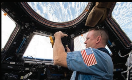
NASA Commander Barry (Butch) Wilmore shoots a scene with the IMAX camera through the window of the International Space Station’s Cupola Observation Module.