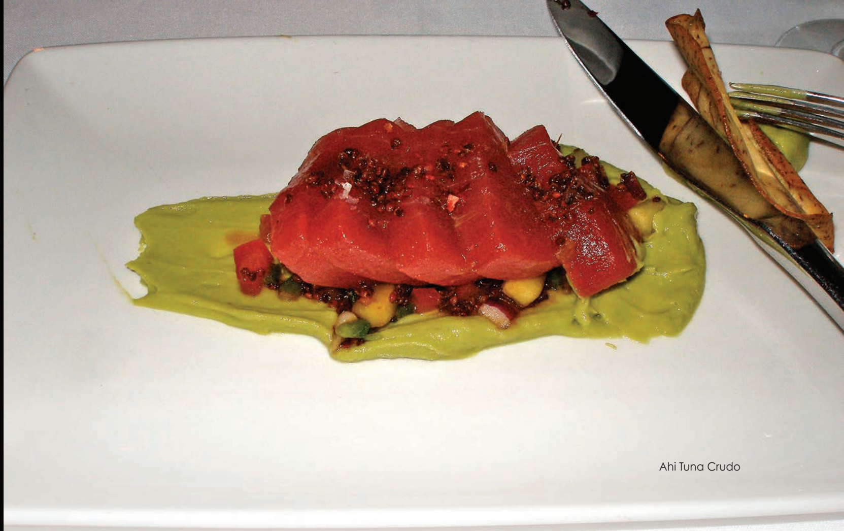
Ahi Tuna Crudo