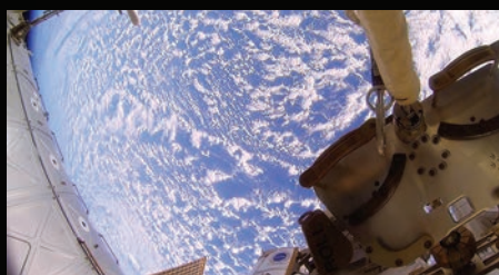
This image is featured in the new IMAX film, ‘A Beautiful Planet,’ narrated by Jennifer Lawrence.