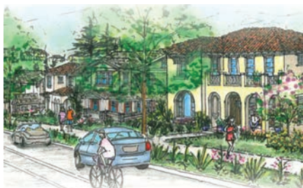
Artist's rendering of homes in Lilac Hills Ranch.

Supervisors said at their July 19 meeting that they were inclined to put the initiative on the ballot. However, they