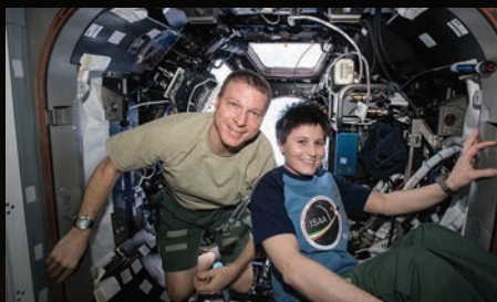
NASA Commander Terry Virts and European Space Agency astronaut Samantha Cristoforetti smiling after her haircut, by Terry.

the earth called “Blue Planet,” she said. “A lot has changed. (Then) the big worry was the ozone hole, and now things have become a lot more urgent.”