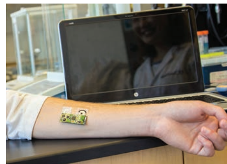
Flexible wearable sensor for detecting alcohol level can be worn on the arm.

“Lots of accidents on the road are caused by drunk driving. This technology provides an accurate, convenient and quick way to monitor alcohol consumption to help prevent people from