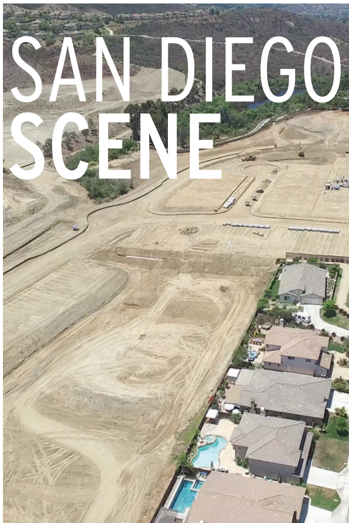
Site of the Rancho Tesoro community in San Marcos.