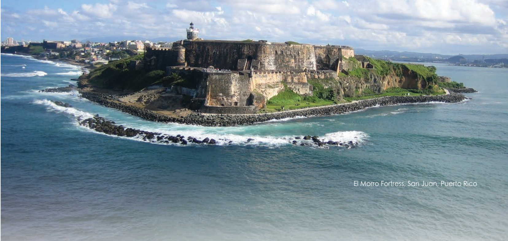
El Morro Fortress, San Juan, Puerto Rico

to get, at most, 70 cents for each dollar they are owed. So the bondholders will be punished by the marketplace.