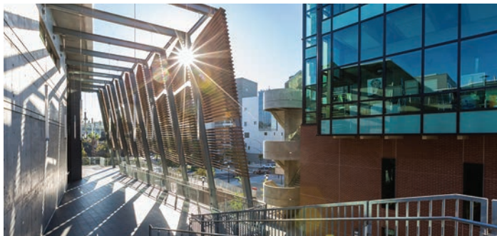
The Arts and Humanities building at City College.

Once the Center for Business & Technology is complete at Mesa College, the only significant project left will be a major renovation of the Dramatic & Fine Arts Building, now in the design phase. The four-story, $14.8-million project will include 26,500 square feet of space within the former I-300 Building, with the main entrance housing the Mesa College Art Gallery.