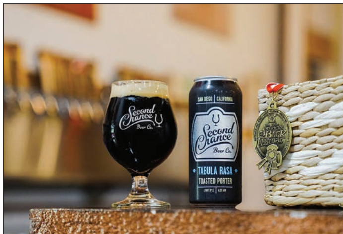
Gold Medal winner for GABF 2016 in the Robust Porter category.