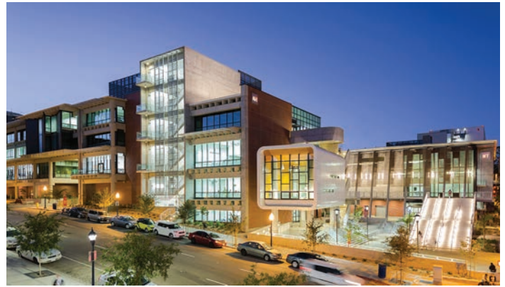
The Arts and Humanities building at City College.

At City College, the most significant remaining project is happening at the Engineering Technology building, where approximately 77,000 square feet of space is being remade to accommodate new homes for the Engineering Department, along with space for the Agriculture Program, the Center for Applied Competitive Tech-