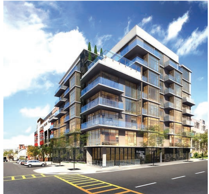
Eighteen Ten State St. building.

Tailored for modern living, the apartments' upscale furnishings showcase floor-to-ceiling windows with nine-foot-high ceilings, private patios, chef-inspired kitchens, walk-in closets, as well as lavish master bath suits and soaking tubs. The hotel-inspired lobby acts as a reception, a co-op workspace, as well as a social community hub with private liquor and wine storage options available to residents.