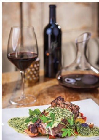
Grilled New York strip.