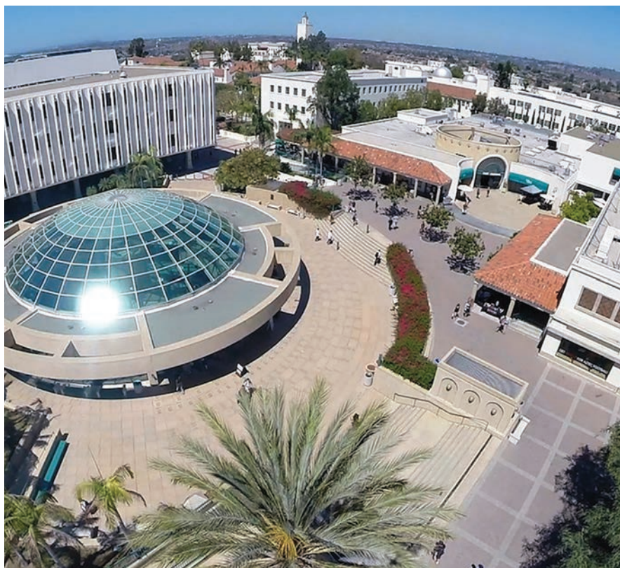
SDSU Aerial View

SDSU's nearly 35,000 students create a total economic impact of more than $226 million in labor income and drive nearly $618 million in industry activity across the region.