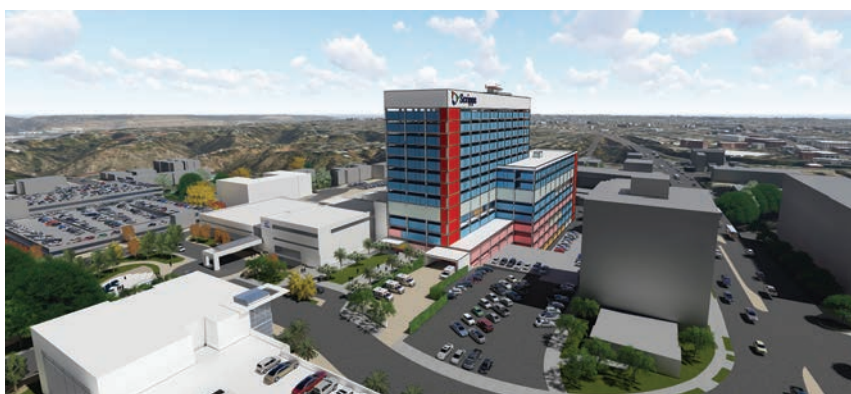
Rendering of Scripps Mercy Hospital San Diego.

The five hospitals: Scripps Mercy San Diego, Scripps Mercy Chula Vista, Scripps Green Hospital, Scripps Memorial Hospital La Jolla, Scripps Memorial Hospital Encinitas.