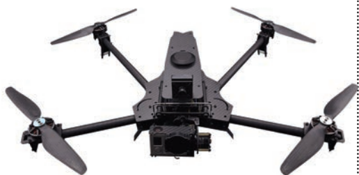
The ADI-Thermal UAV from Action Drone, a Chula Vista company that was one of the first businesses to use the testing site.