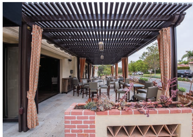
Enjoy the breeze on the large outdoor patio.