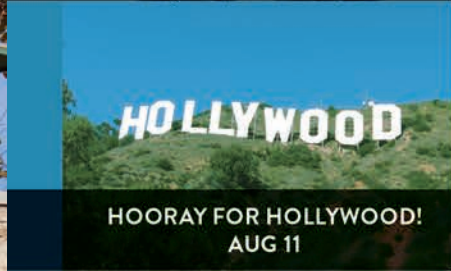
HOORAY FOR HOLLYWOOD! AUG 11