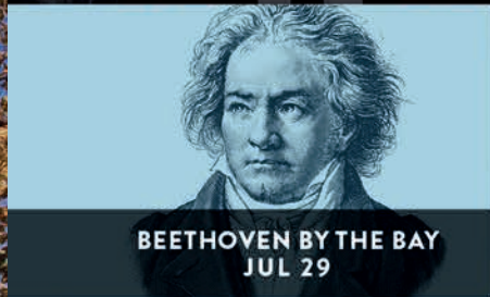
BEETHOVEN BY THE BAY JUL 29