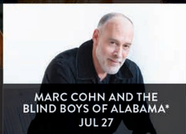
MARC COHN AND THE BLIND BOYS OF ALABAMA* JUL 27