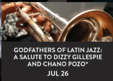
GODFATHERS OF LATIN JAZZ: A SALUTE TO DIZZY GILLESPIE AND CHANO POZO* JUL 26