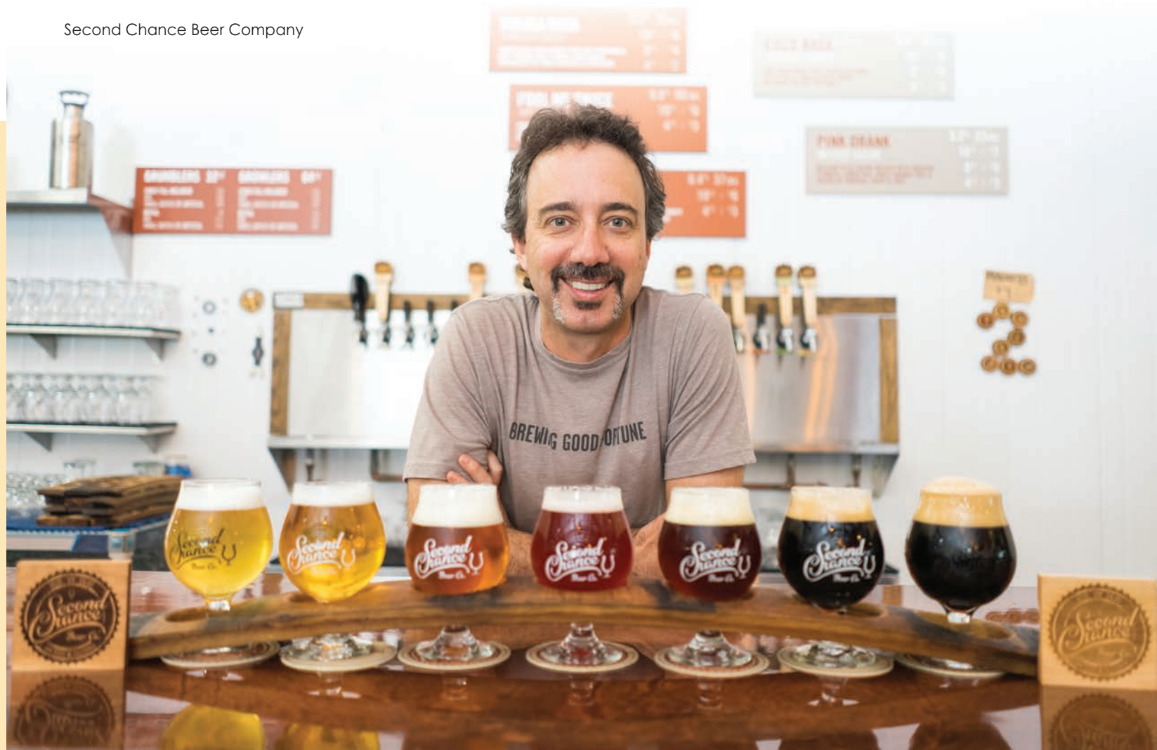
Second Chance Beer Company