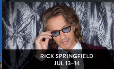
RICK SPRINGFIELD JUL 13-14