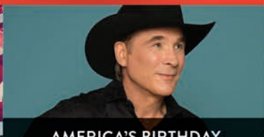
AMERICA'S BIRTHDAY WITH CLINT BLACK JUL 4