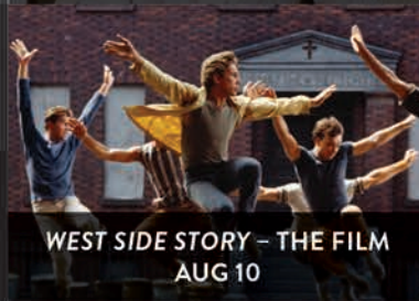
WEST SIDE STORY - THE FILM AUG 10