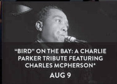
"BIRD" ON THE BAY: A CHARLIE PARKER TRIBUTE FEATURING CHARLES MCPHERSON* AUG 9