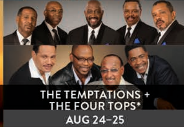
THE TEMPTATIONS + THE FOUR TOPS* AUG 24-25