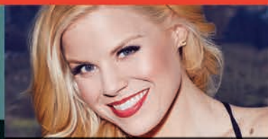
MEGAN HILTY JUL 6-7