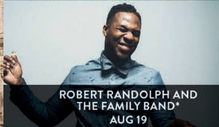
ROBERT RANDOLPH AND THE FAMILY BAND* AUG 19