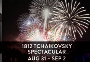
1812 TCHAIKOVSKY SPECTACULAR AUG 31 - SEP 2

TICKETS & INFORMATION | SANDIEGOSYMPHONY.ORG