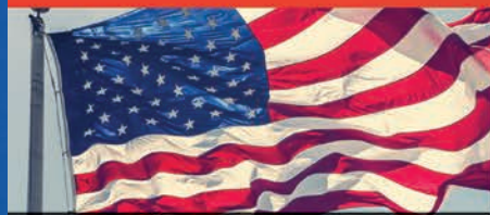
STAR SPANGLED POPS JUN 29 - JUL 1