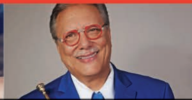
ARTURO SANDOVAL* JUL 12