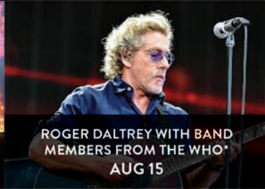
ROGER DALTREY WITH BAND MEMBERS FROM THE WHO* AUG 15