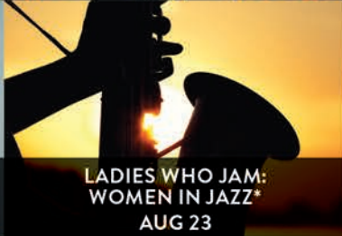
LADIES WHO JAM: WOMEN IN JAZZ* AUG 23