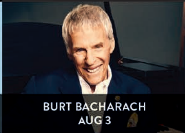
BURT BACHARACH AUG 3