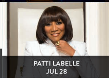
PATTI LABELLE JUL 28