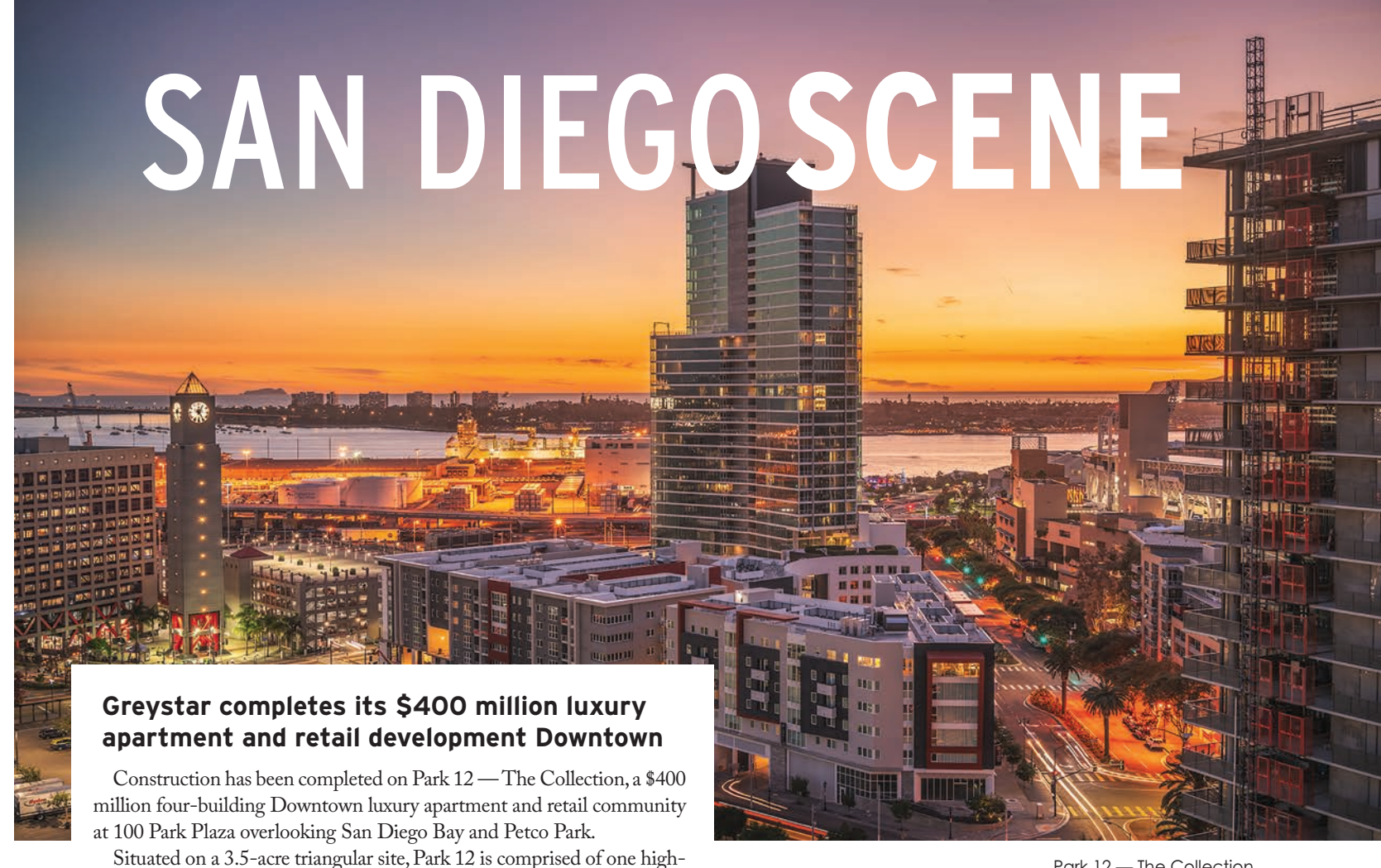
Park 12 — The Collection