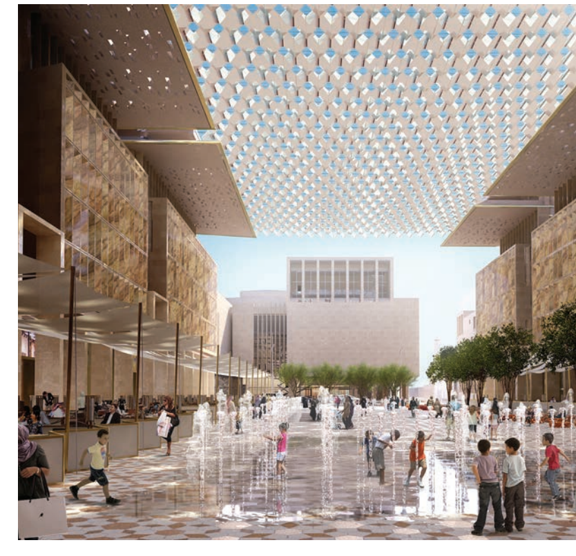
Burton Studio rendering: Al Barahat square, the region's largest covered space at over 2 acres.

A jewel of Msheireb is Al Barahat Square, the region's largest covered public square at over two acres. Close in size to Venice's Piazza San Marco, the Al Barahat was envisioned by the design