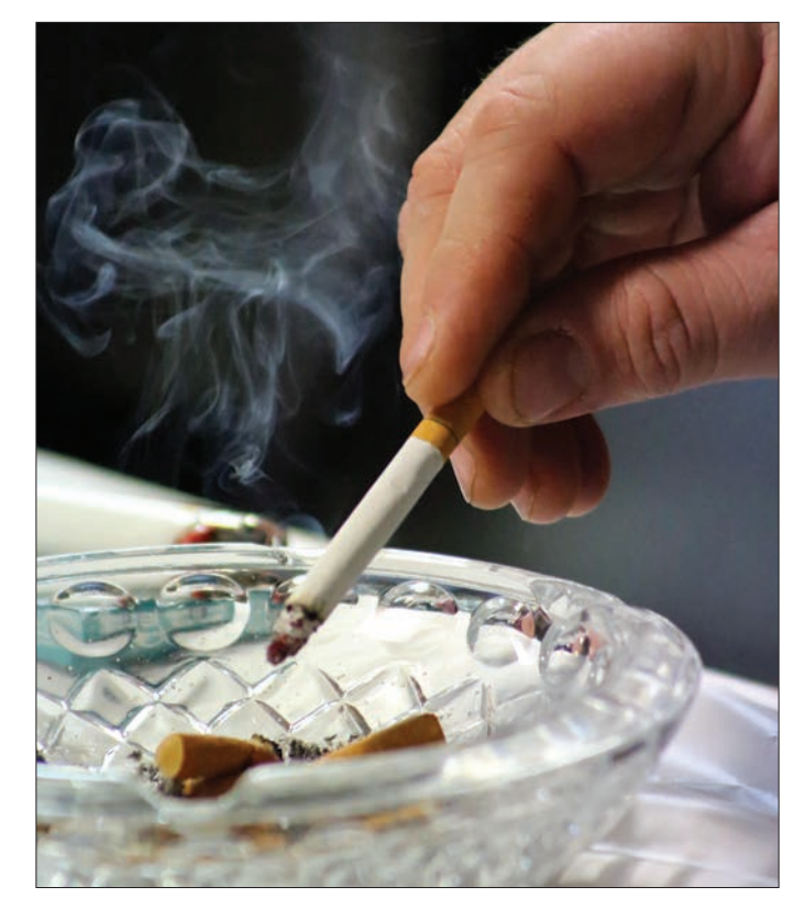
Residue from smoking tobacco and vaping electronic cigarettes includes a mixture of toxic chemicals known to cause cancer and asthma.

"You can imagine someone with a pack-a-day habit over a 10-