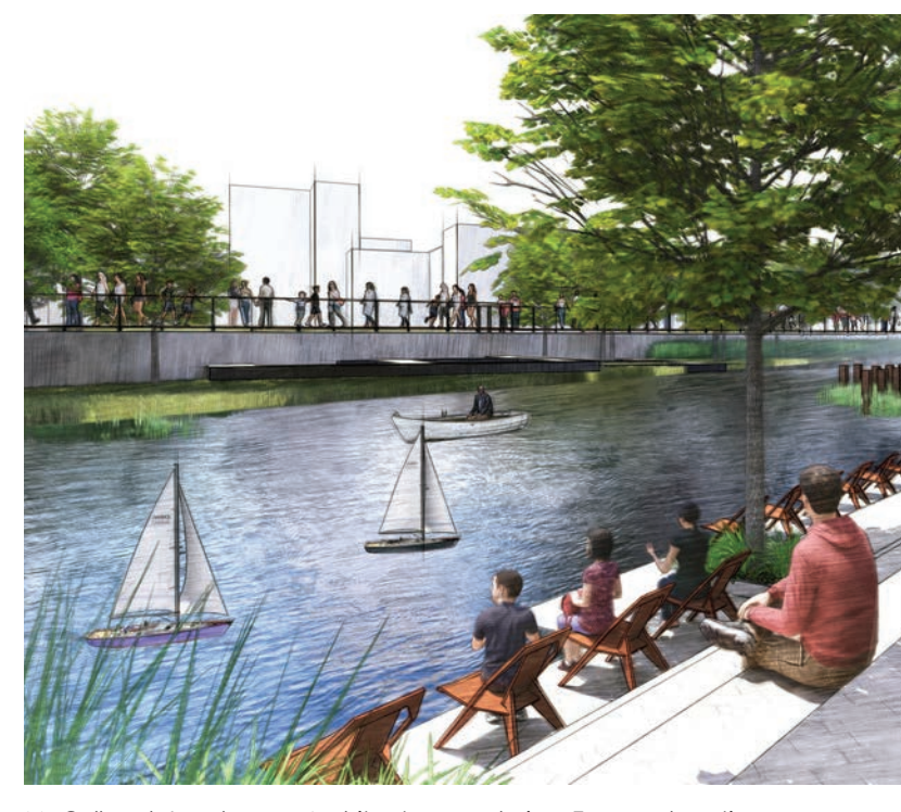
McCullough Landscape Architecture rendering: Terraced seating elements allow direct interaction to the river, connecting the users to the water.