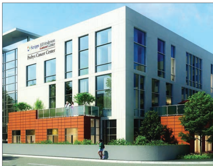
Prebys Cancer Center rendering

Patients at Prebys Cancer Center will have access to leading-edge radiation therapy technology, including two TrueBeam linear accelerators, which deliver external beam radiation treatments with exceptional accuracy and speed. Additionally, the facility will house a 20-chair infusion center, where chemotherapy, targeted therapy, immunotherapy and other treatments will be delivered. The new center also will include spaces for treatment planning conferences, patient exams and consultations, physician offices and patient support services. A new 140-space parking garage, expected to open in 2022, will adjoin the facility.